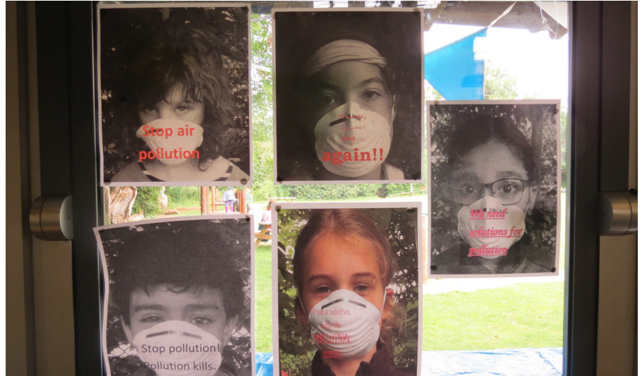
Pre-Covid, Year 5 practice skills of political communication starting from the question Do we have the power to change the world?

Order in schools is best maintained when conceptualized in line with the principles of the CRC (Osler 2000 viii ; Ekholm 2004 ix ; Durrant and Stewart-Tufescu 2017 x ). Rules are better kept by staff and students if democratically agreed (Harber 1995 xi ). This is confirmed by the experience of many schools that have adopted UNICEF UK's Rights Respecting Schools initiative xii .