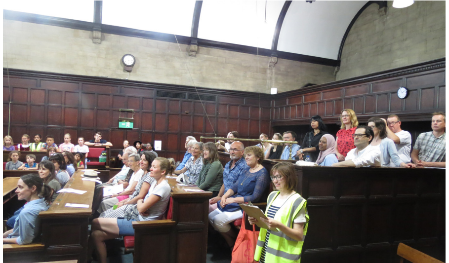
Parents and governors listen in the Town Hall to Year 4 children's teach-in on the climate emergency, the result of an enquiry Can we future-proof our planet?

Democracy is an ideal built by citizens and since the mid-20th century supported by the concept of human rights. As well as a system of government, it is also a way of looking at the world in terms of social structures that respect dignity and human rights, irrespective of any particular political arrangement. The eminent American philosopher and educationalist John Dewey (1859–1952) argued in Democracy and Education (1916) that although democracy is often associated with a form of government, it is also a principle that can be applied more