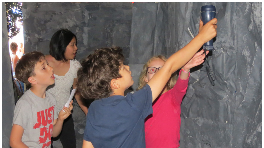
Year 3 children ask What do human beings need to survive. Do we need art and why? They learn communications skills by building their own prehistoric cave with wall art and offering guided tours.

Dewey argued that democracy requires 'a large number of values in common' ([1916] 2002 : 97) achievable by interaction within and between communities. All perspectives including those of minorities should find expression and be considered. This provides opportunities to continuously revisit habits, processes and procedures and to develop new perspectives and