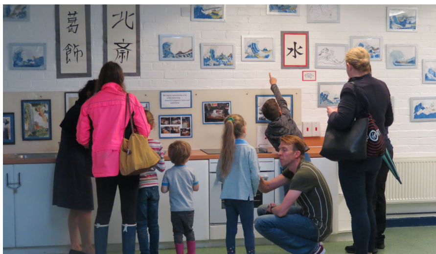
Year 2 children ask Is water the most precious thing in the world? They put on an art exhibition based on Hokusai, for parents and visitors

Debra Kidd, and part-funded by ASPE, the school developed an enquiry-based curriculum based on people, places, problems and possibilities. Year 1 ask: how can we help other people feel like they belong? Children work with both older people in the community and younger children preparing to move from EYFS. Year 3 children ask What do human beings need to survive? Do we need art and why? They learn communication skills by building their own prehistoric cave with wall art and offering guided tours. Year 5 have power and leadership as an overall